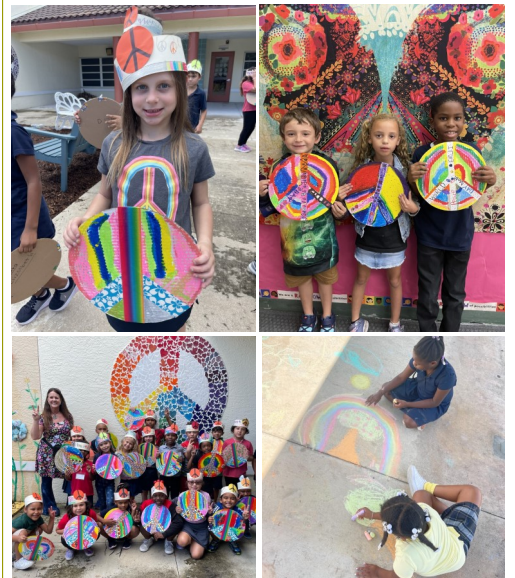
International Day of Peace